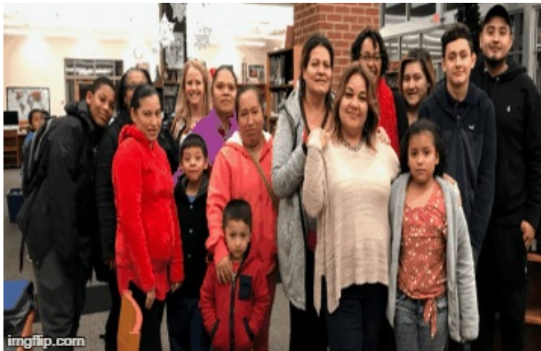
GMS parents engage in informative discussions