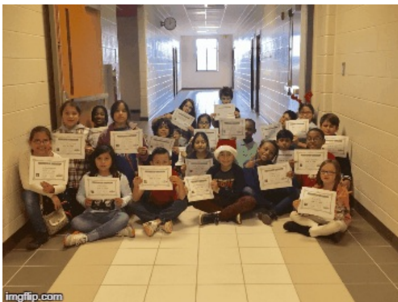
Students enjoy various coding activities

Gainesville City Schools participated in the Hour of Code during the week of December 4th - 10th. Students were engaged in one hour of