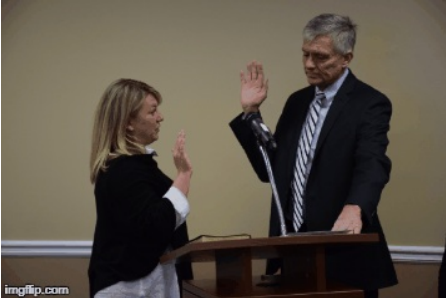
Gainesville City BOE Called Meeting