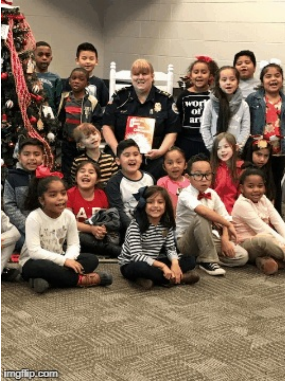
Community volunteers read to students

Mundy Mill Learning Academy's first annual "Rock and Read" was a great success! On December 13th, several distinguished guests graciously volunteered their time to read holiday-themed stories to students. The event promoted the importance of reading and increased community involvement at the school.