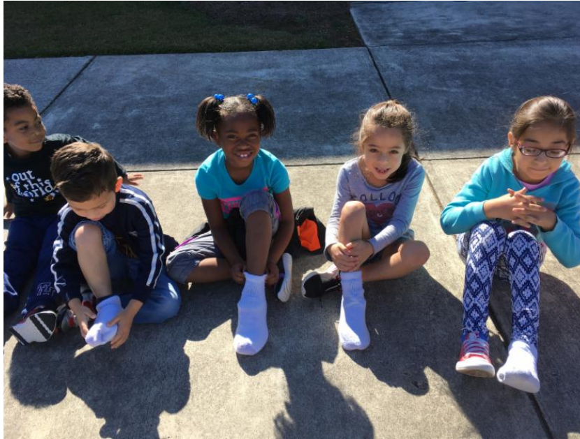
MPACT students enjoy walking on the wild side

Are you willing to take a walk on the wild side? Students at New Holland Knowledge Academy are eager to take a daring risk every once in a while! New Holland's MPACT students in first and second grades took a walk on the wild side as they put old socks over their shoes to see how many seeds would stick to them. The students then put the socks in a cup with a little water. Over the next few weeks, they will observe their seeds to see how many will sprout! Now that is wild!