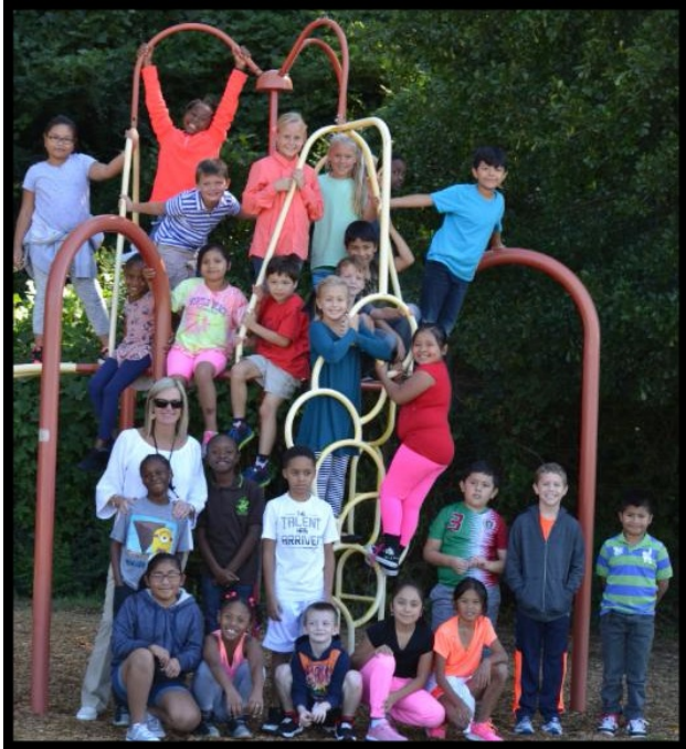
Students at Centennial display positive behavior

Positive Behavioral Interventions and Supports (PBIS) is a systems approach to establishing social culture and behavioral support for students to achieve optimal social and academic success. Recognizing the need for consistent expectations that must be explicitly taught and reinforced, Gainesville City strives to create Ready, Respectful, Responsible, Role Models. In only our second year of full district-wide PBIS implementation, GCSS is exceeding requirements for proactive and preventative behavior support by reducing problem behaviors by 37%. To further demonstrate PBIS success, all GCSS schools have achieved a 4 or 5 star climate rating, and the district was chosen to present Gainesville City's PBIS work at the state-wide PBIS conference in an effort to inspire other Georgia systems. Continuing the tradition of excellence, Fair Street International Academy has also been selected to present at the 2017 Georgia PBIS State Conference. Fair Street's leaders will be sharing their work with PBIS highlighting reductions in discipline referrals and explaining strategies that have made a difference. We applaud each of our schools and their commitment to student success. As One Gainesville, students and staff strive to be Ready, Respectful, Responsible, Role Models.