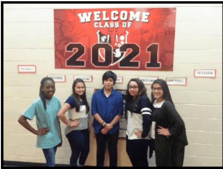
2016 REACH Georgia Scholars

Gainesville City School System encourages the community to support our REACH Georgia Scholars program by making a financial contribution to provide an opportunity for select GCSS students to pursue a college education. REACH Georgia is a needs-based scholarship program that pairs middle school students (Scholars) with mentors, coaches and additional resources to prepare them for college and careers. REACH Scholars who successfully complete the program and graduate from high school earn a $10,000 scholarship paid over four years at a Georgia college or technical college of their choice. 100% of all donations collected will contribute toward REACH scholarships.