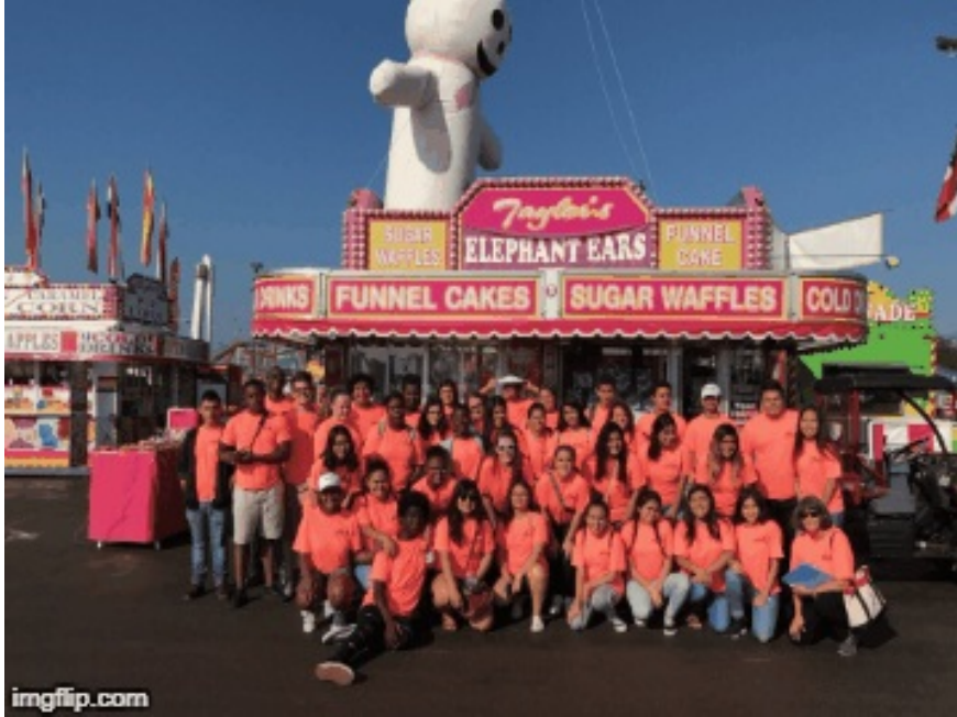
FCCLA students compete in bowl competition