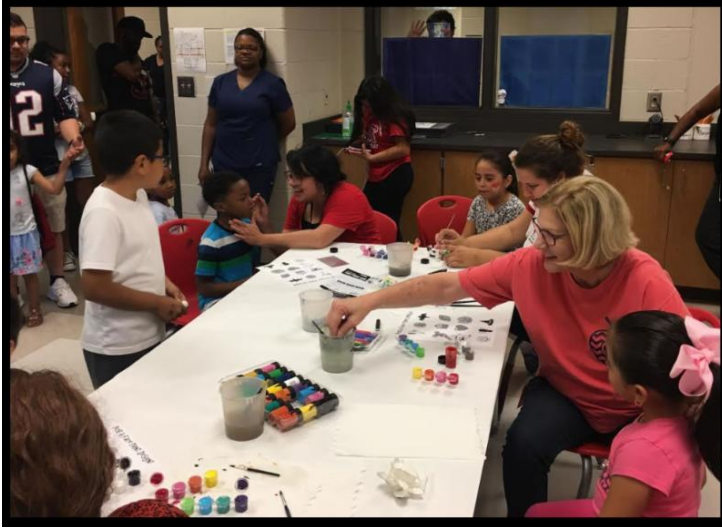
Students receive face painting at festival