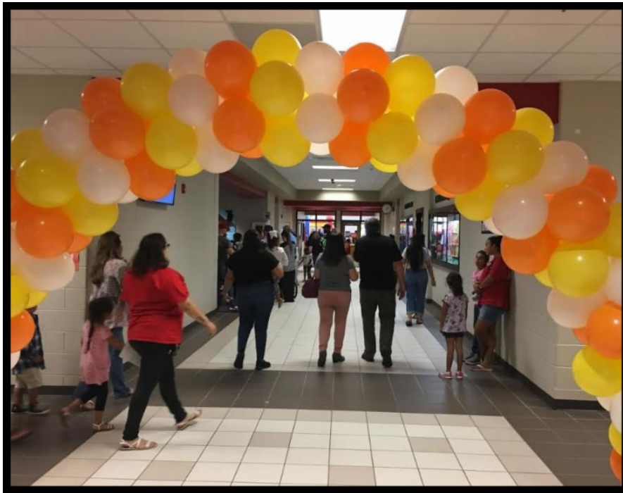
Mundy Mill Academy's 2nd Annual Fall Festival

Mundy Mill Learning Academy held its 2nd Annual Fall Festival on October 4th with over 290 children and their families in attendance. Everyone enjoyed games such as Ladder Ball, Cornhole, Crazy Ball Maze, Pumpkin Hula Toss, Candy Corn Spoon Race, and a Treat Walk. Younger children were treated to bouncy houses and face painting. There were delicious treats such as nachos, popcorn, and drinks to eat while participating in fun, engaging activities. The school's business partner, US 1 Taekwondo, provided a demonstration and gave students the opportunity to practice some moves, including breaking boards. Baskets filled with goodies from local businesses were raffled to six lucky winners. The school also opened its Book Fair to allow guests to purchase books of their interest. It was the perfect afternoon for families to enjoy spending time together while having lots of fun!