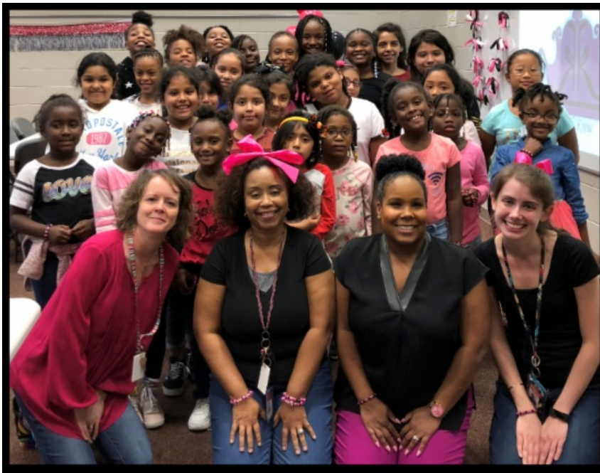
Fair Street Academy's Kamili Krew