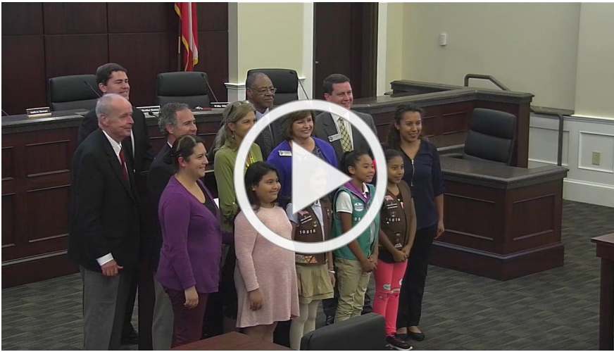
Gainesville City Board of Education - Regular Meeting - October 15, 2018