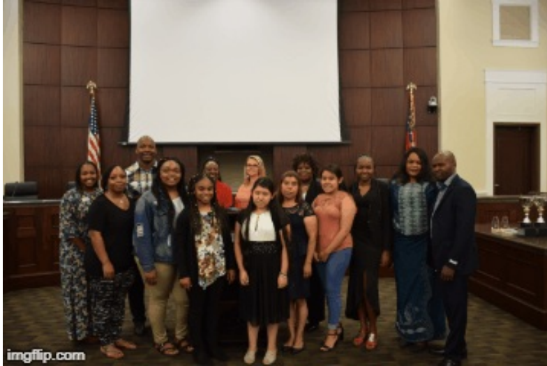
REACH GA Signing Ceremony