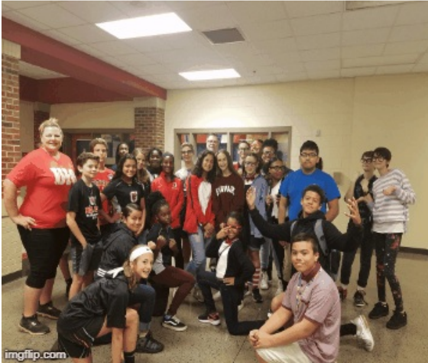
GMS students and staff show their school spirit

Students and staff at Gainesville Middle School showed a lot of "Big Red" Spirit as they celebrated Spirit Week at their school. Themed days such as Shine Bright, Nerd vs. Jocks, Hawaiian Day, Red Out, and Dynamic Duo/Twin Day challenged everyone to show their unique and, in some cases, unusual style of dress. There was also a door decorating competition to see which classroom had the best door that displayed school pride. To conclude the exciting week, a pep rally was held for everyone to cheer and chant as part of the Red Elephant herd. It was a great experience for the entire student body, especially the new sixth graders who received a quick lesson on how their older peers show their "Big Red Spirit" at GMS.