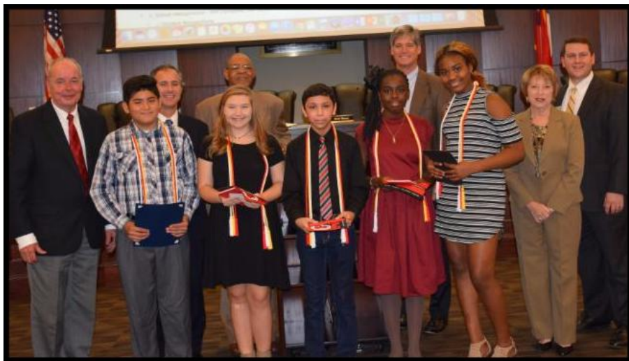
GCSS 2017 REACH Georgia Scholars

Gainesville City School System encourages the community to support our REACH Georgia Scholars program by making a financial contribution to provide an opportunity for select GCSS students to pursue a college education. REACH Georgia is a needs-based