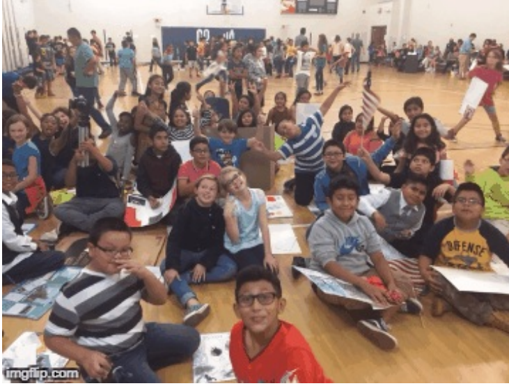
Students at New Holland earn several 4-H awards

The 4-H motto states, "To make the best better", and that's exactly what New Holland Knowledge Academy strives to do! Fifty-one fifth graders from New Holland aimed to show their best in the 4-H Project Achievement Competition on October 23rd at Friendship Elementary School. The students worked on their projects in class and at home diligently for three weeks to make the projects the "best as could be". Students were required to research a subject and create a speech along with a presentation using visual aids. The subjects included: Historic People, Dog Care and Training, Career Development and Workforce, Foods, International Cultures, Barn Owls, Wolves, Slime, Komodo Dragons, Video Games, Hummingbirds, Photography, Textiles, and Crafts. The students' hard work paid off, resulting in them earning several awards. New Holland had seven first place winners, eight second place winners, and six third place winners. We are proud of these students for their hard work and for "doing their best" in the 4-H competition!