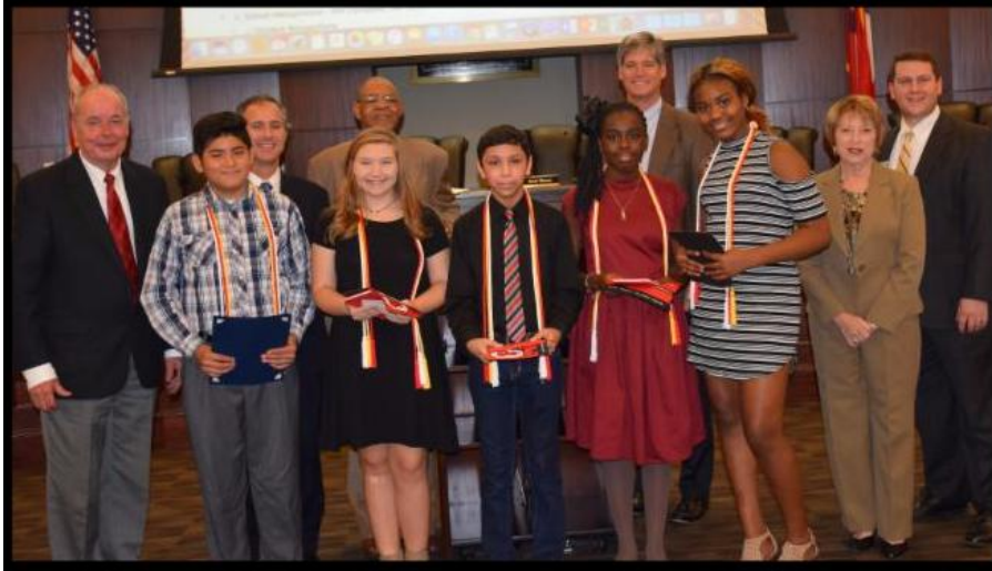
GCSS 2017 REACH Georgia Scholars

Gainesville City School System encourages the community to support our REACH Georgia Scholars program by making a financial contribution to provide an opportunity for select GCSS students to pursue a college education. REACH Georgia is a needs-based scholarship program that pairs middle school students (Scholars) with mentors, coaches and additional resources to prepare them for college and careers. REACH Scholars who successfully complete the program and graduate from high school earn a $10,000 scholarship paid over four years at a Georgia college or technical college of their choice. 100% of all donations collected will contribute toward REACH scholarships.