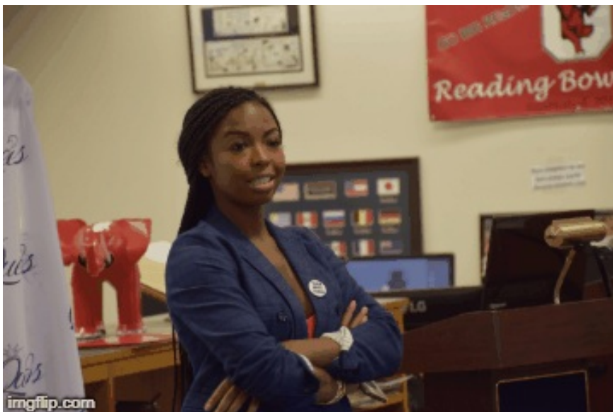
Women's Career Week at GHS

Gainesville High School's 500 Queens organization hosted Women's Career Week on October 22nd through October 26th. Several women leaders