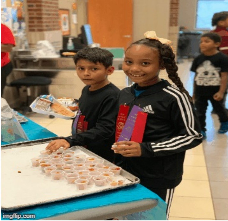
Students sample menu options featuring kale

The GCSS School Nutrition program has been featuring various Farm to School initiatives at specific schools each month throughout the school year. During the month of October, Fair Street Academy hosted a "Kickin' it with Kale" taste-test event. Students sampled a variety of interesting foods such as Parmesan Kale Chips, Maple Roasted Sweet Potatoes, and Kale, Apple, and Feta Salad. Exposing students to different foods allows them to expand their menu options while introducing new, healthier choices to their palates.