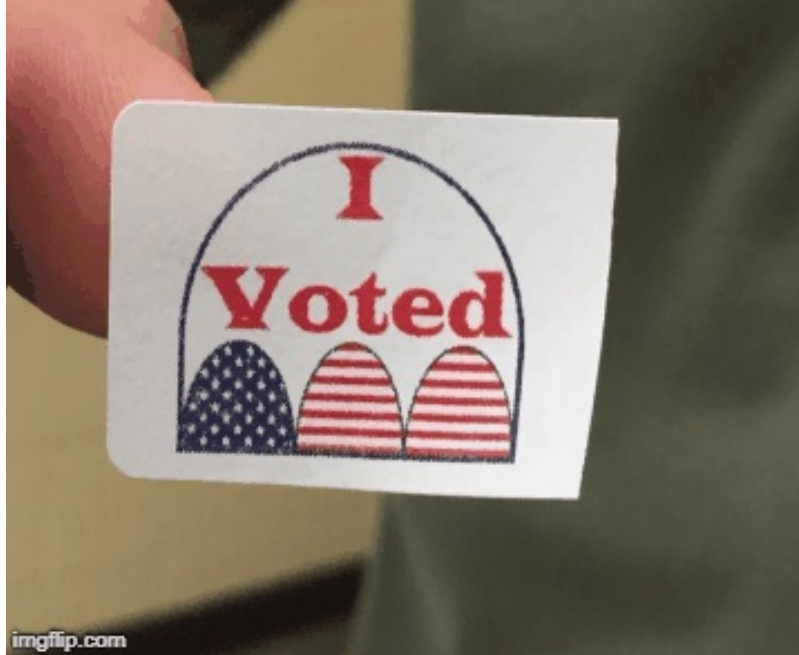
Students cast votes in mock election

November 6th was Election Day! Not only were registered voters around the nation allowed to cast their votes, but students at Gainesville Middle School were able to vote too! Voting booths were set up in the GMS media center to allow students to participate in a mock election by casting their votes for their favorite candidates. Students were able to vote for the Governor of Georgia, other candidates' races, and on several of the amendments that were proposed on the real election ballot. The mock election was a hands-on, educational activity for students, enabling them to learn about the election process and about how our nation's democracy works. Hopefully, the election served as an inspiration for students to exercise their rights to vote when the opportunity arises in the future.