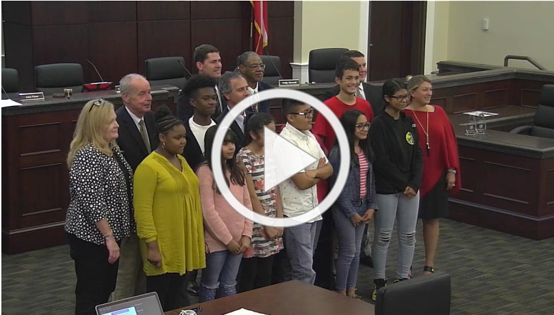
Gainesville Board of Education - Regular Meeting - November 5, 2018

To view the televised meeting, please click on the link below.