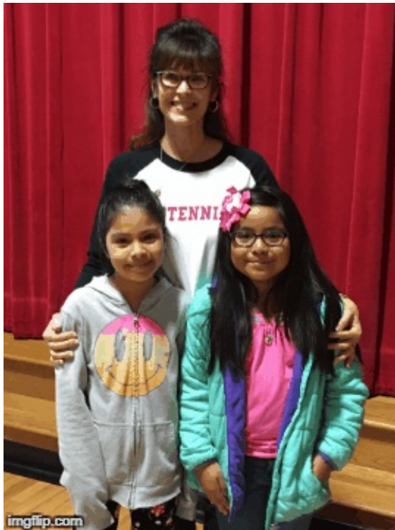
Spanish Spelling Bee Champions

On November 17th, Centennial Arts Academy held its first Spanish Spelling Bee for grades 1 through 5. To prepare for the event, students studied review sheets of Spanish vocabulary such as days of the week, numbers, colors, and other categories. Students played classroom games to practice, then finally, they participated in formal classroom competitions. In grade 1, the competition was very informal. Grade 2 was more formal, but competitions were held only in each individual classroom since it was some students' first experience participating in a spelling bee.