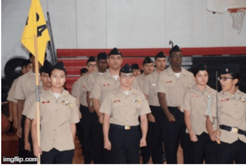
Cadets in action at Annual Military Inspection

Gainesville High School's NJROTC program held its Annual Military Inspection (AMI) on November 29th at the GHS Ninth Grade Center. The inspection was an official, intensive review of the JROTC unit's administrative and logistical processes in which cadets were inspected on all aspects of the program and were evaluated by the Higher Headquarters (HHQ) from the US Navy. The purpose of the inspection was to place on display the unit's cadets during the ceremonial portion as well as conduct an in-depth review of the instructors. In addition to the programmatic inspection, the cadets had to undergo a Personnel Inspection in which their uniforms were inspected and they were quizzed on their military knowledge. The ceremony included demonstrations by the Unarmed and Armed Exhibition Teams, recognition of awards for Exemplary Personal Appearance, and recognition of the Honor Platoon. In preparation for the event, cadets worked tirelessly perfecting their military drills to demonstrate during the final Pass In Review during the ceremonial phase while also paying special attention to their uniforms and shoes for personnel inspection. The Annual Military Inspection is one of the most important components of the NJROTC program during the school year and serves as a source of pride for all of the cadets involved.