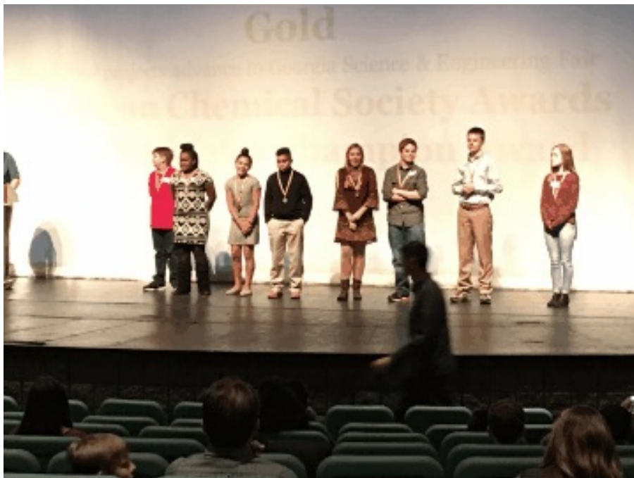
GMS and GHS students compete in regional science fair

Gainesville Middle School and Gainesville High School students participated in their first Regional Science Fair on January 27th with a total of 30 students attending the event. The students did a fantastic job with their projects, which involved long hours and several months of conducting research, experimenting, analyzing results, logging data, and creating presentation boards.