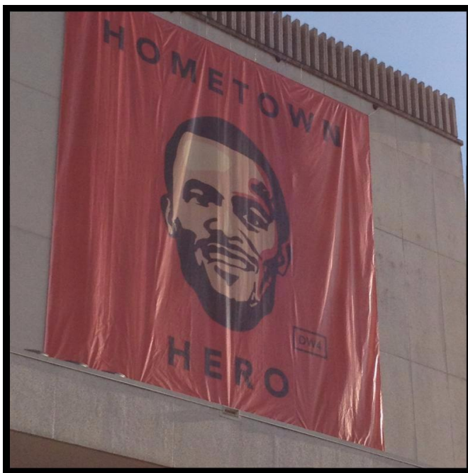
Former GHS Red Elephant Deshaun Watson

Have you seen the latest tribute to Gainesville's hometown hero? In