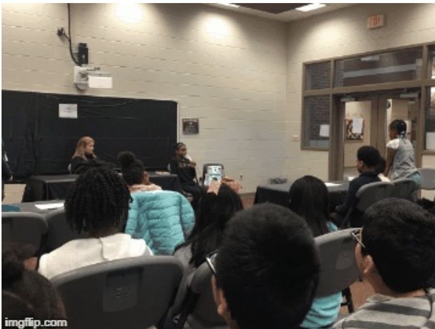
Students debate an interesting topic