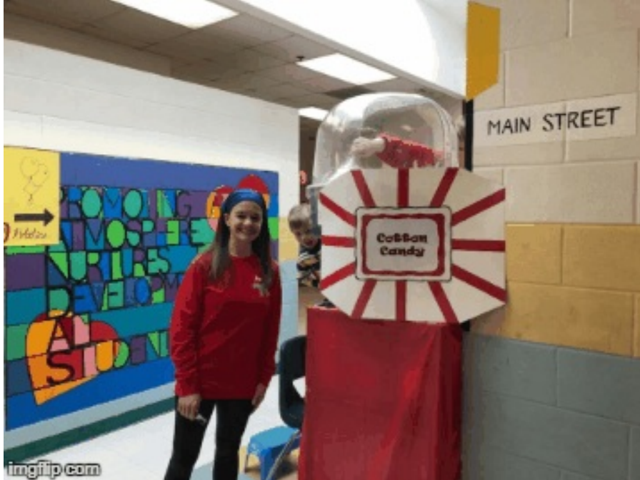
Students and their families enjoy annual Enota fair

Enota MI Academy recently held its annual Multiple Intelligences Fair on January 25th. This year the school decided on a carnival theme in which students created their own carnival games. All fourth and fifth graders researched, drew blueprints, and created games made of recycled materials. The top twenty games were then chosen to be displayed and played at the MI Fair. Second and third graders brainstormed and created their own putt-putt courses. Kindergarten and first grade students got in on the fun and made slime to hand out as prizes for the games.