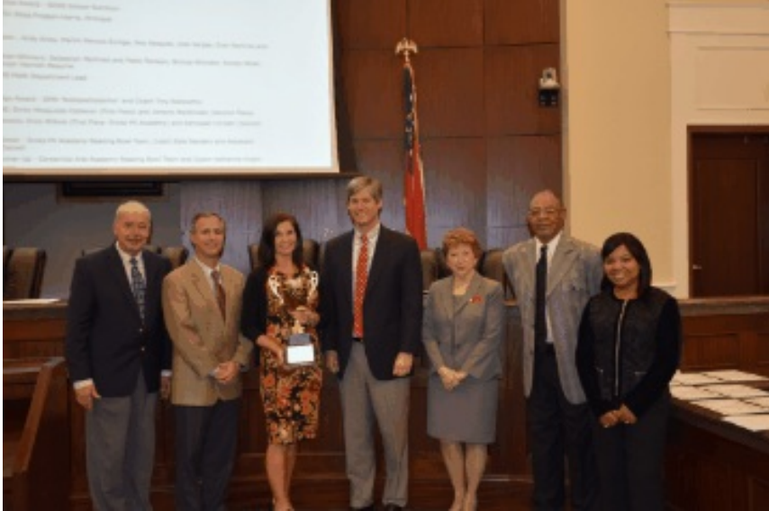
Special guests recognized at BOE meeting