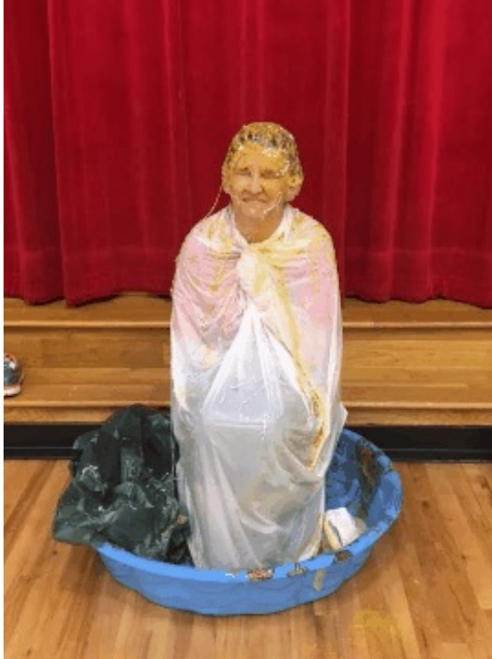
Teachers and principal get slimed