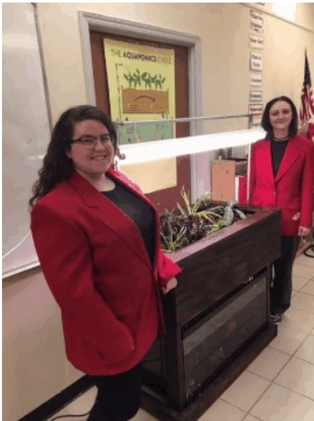
Classes design and create an aquaponic garden

Have you ever seen an aquaponic garden? In case you haven't, stop by the GHS main office to see the school's new garden, a joint project by students in FCCLA, AP Human Geography, Culinary Arts & Construction. An aquaponic garden is a self-sustaining garden that uses the waste from fish to feed plants and the roots of the plants to clean the water before it filters back to the fish.