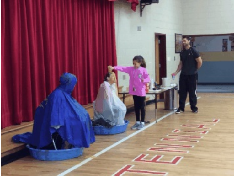
Students jump rope for a "hearty" cause

Students at Centennial Arts Academy raised approximately $8,000 through Jump Rope for Heart for the American Heart Association. The fundraising event enabled students to show their jump roping skills while raising money to help children with heart conditions. The students had lots of fun jumping rope but, most importantly, they learned the importance of staying healthy and the value in making a difference in the lives of others.