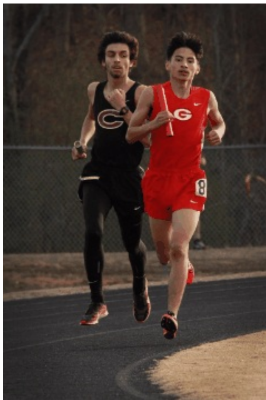
Track teams compete at West Hall

On Friday, February 17th, the Gainesville High School Boys and Girls Track teams competed in the West Hall Relay Invitational at West Hall High School where the girls finished third place overall and the boys finished in first place overall. A total of twelve teams around the region competed in the event.