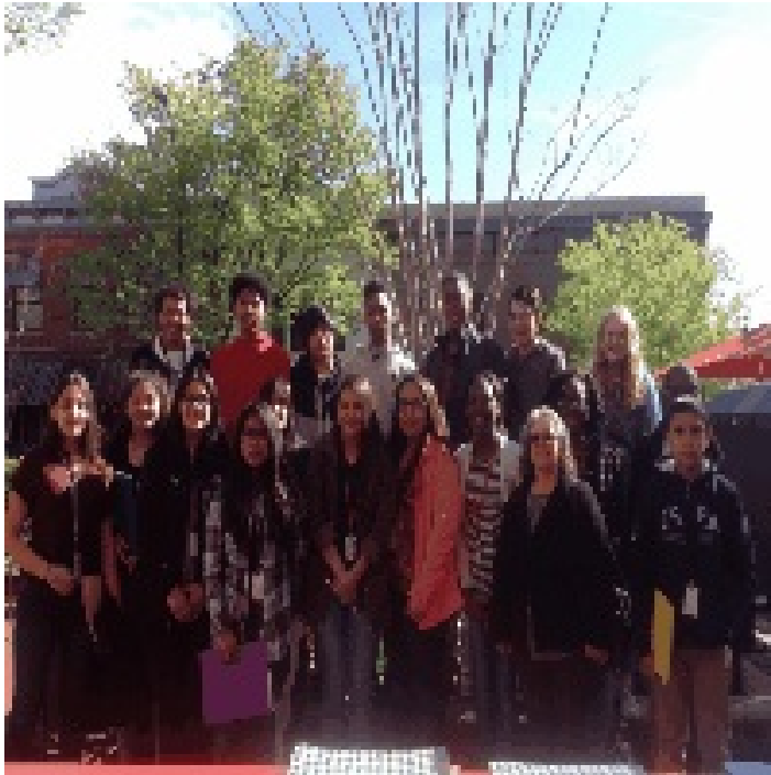
GMS students experience college life at UGA

So far this school year, the University of Georgia was the second college visited by the Gainesville Middle School REACH scholars and 6th, 7th and 8th grade peer tutors' helpers.