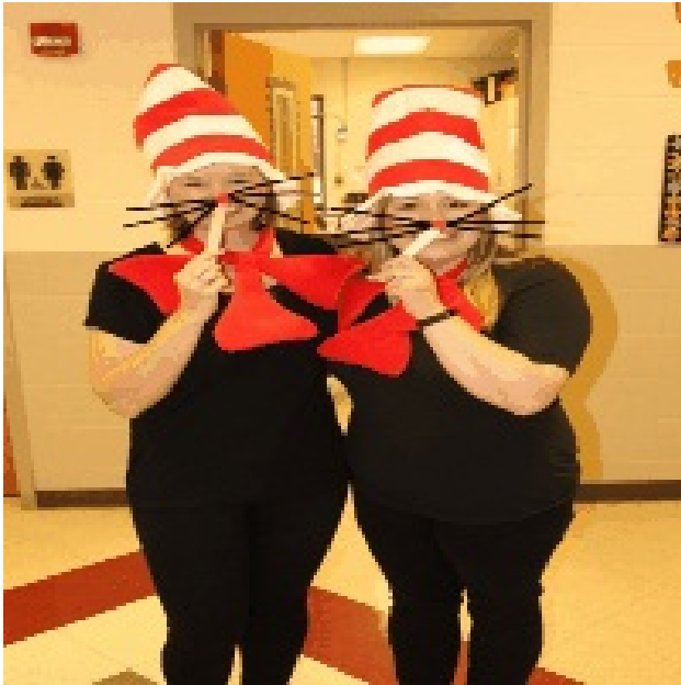
Students and teachers dress up as various characters

On March 2nd, schools across the nation celebrated Read Across America Day which was also Dr. Seuss's birthday. All GCSS elementary schools honored Dr. Seuss's birthday with students and teachers dressing up as their favorite Dr. Seuss book characters. Enota students were excited to see the Lorax standing in the lunch line next to the Cat in the Hat, and they were really excited to have a visit from the Grinch. New Holland celebrated with themed days throughout the week such as Twin Day, Dress for Success Day and Wacky Socks Day. Centennial, Enota, Fair Street, and Gainesville Exploration students also participated in fun activities to celebrate the special event. Guest readers visited schools and volunteered their time by reading to students. Enota children were excited to meet members of the Gainesville High School football team. Students had a great time celebrating Dr. Seuss's birthday, but they had just as much fun reading their favorite books!