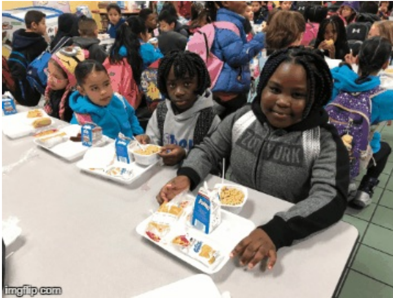
Students eat nutritious meals during school day

March is designated as National Nutrition Month in an effort to increase public awareness regarding the importance of making informed food choices and developing solid eating and physical activity habits. For the entire month, the community is encouraged to "Go Further with Food" by focusing on good nutrition.