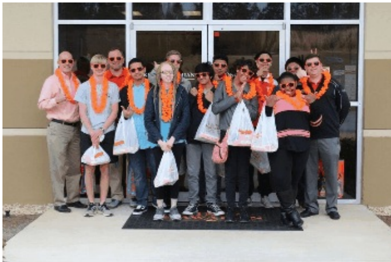
GHS students visit local industries

Gainesville High School, in collaboration with the High School High Tech organization, has taken students to two different tours during the month of February. The students' first trip was to King's Hawaiian and Lanier Technical College. The second trip was to the Caterpillar Plant in Bogart, Georgia. Students met with counselors and industry specialists to learn more about opportunities and the next steps that they can take after they graduate from high school.