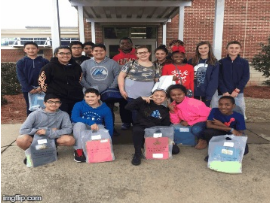
Students from GMS participate in youth summit

Sixth grade students from Gainesville Middle School and Hall County attended the Youth Empowerment Summit also known as Students Together Achieving Responsibility and Tolerance (START) on February 15th at First Presbyterian Church.