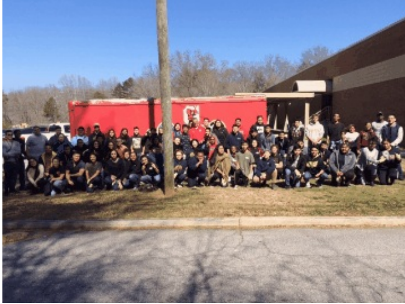
JROTC cadets engage in community service

Gainesville High School JROTC cadets recently volunteered their time and services to the community. As part of the group's community service project, the cadets cleaned Longwood Park, Wilshire Trails, and Holly Park, removing 2555 pounds of debris as well as 20 old tires from the premises.