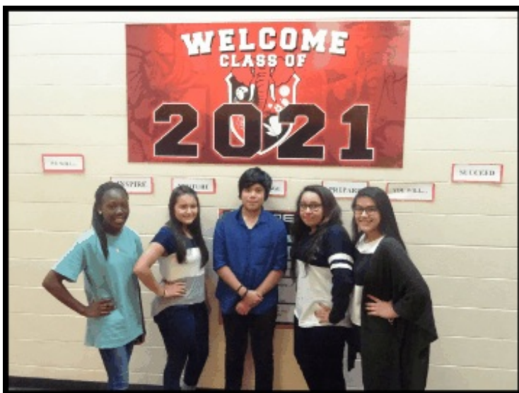
2016 REACH Georgia Scholars

Gainesville City School System encourages the community to support our REACH Georgia Scholars program by making a financial contribution to provide an opportunity for select GCSS students to pursue a college education. REACH Georgia is a needs-based scholarship program that pairs middle school students (Scholars) with mentors, coaches and additional resources to prepare them for college and careers. REACH Scholars who successfully complete the program and graduate from high school earn a $10,000 scholarship paid over four years at a Georgia college or technical