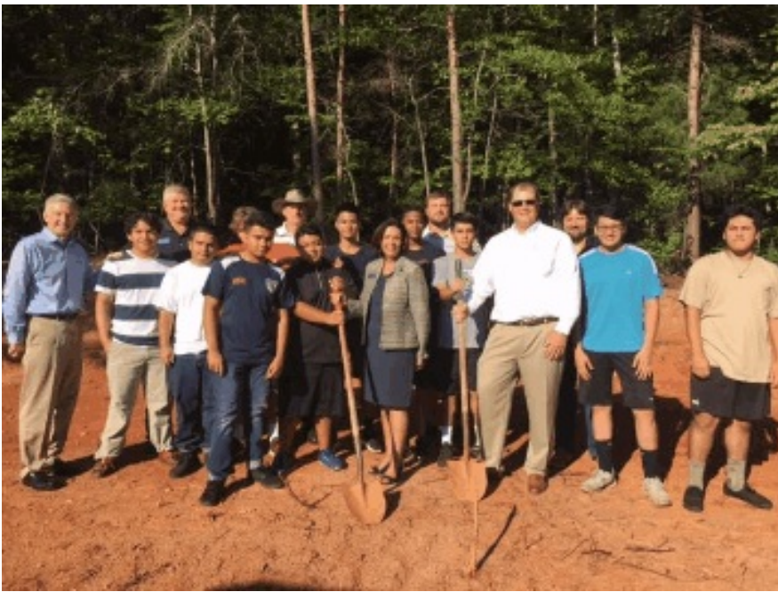
Students volunteer to build Habitat house

Habitat for Humanity of Hall County held a dedication and blessing ceremony on March 17th to celebrate the completion of a newly constructed home. Several people gathered to bestow well wishes to the new homeowners as they begin to settle in their new home. The special celebration included many volunteers (and supporters) who invested their time and services to assist in constructing the home for the family.