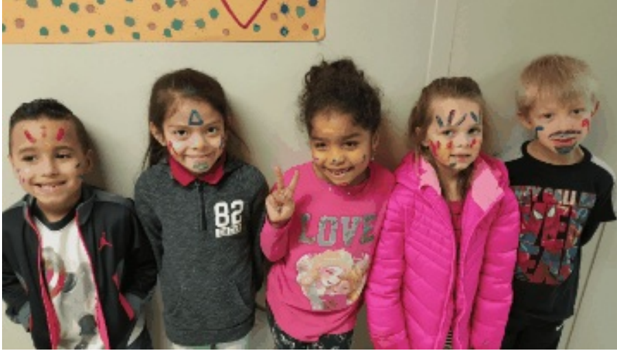
GEA students are #ArtSmart