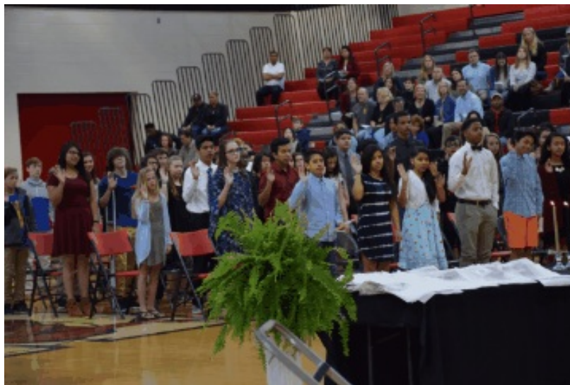
GMS Junior Beta Club Induction Ceremony