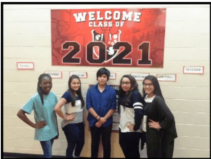
2016 REACH Georgia Scholars