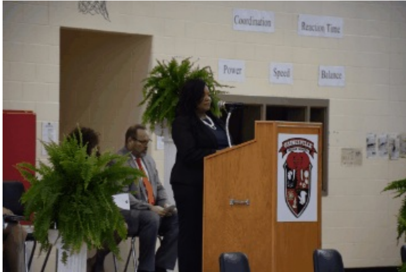
GMS Junior Honor Society Induction Ceremony