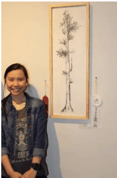
GHS art students showcase their artwork

Gainesville High School artists featured their unique artworks in the Charles J. Thurmond Youth Art Scholarship Competition and the Kiwanis Club of Gainesville's Visual Arts Showcase. Students entered