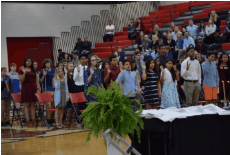
GMS Junior Beta Club Induction Ceremony