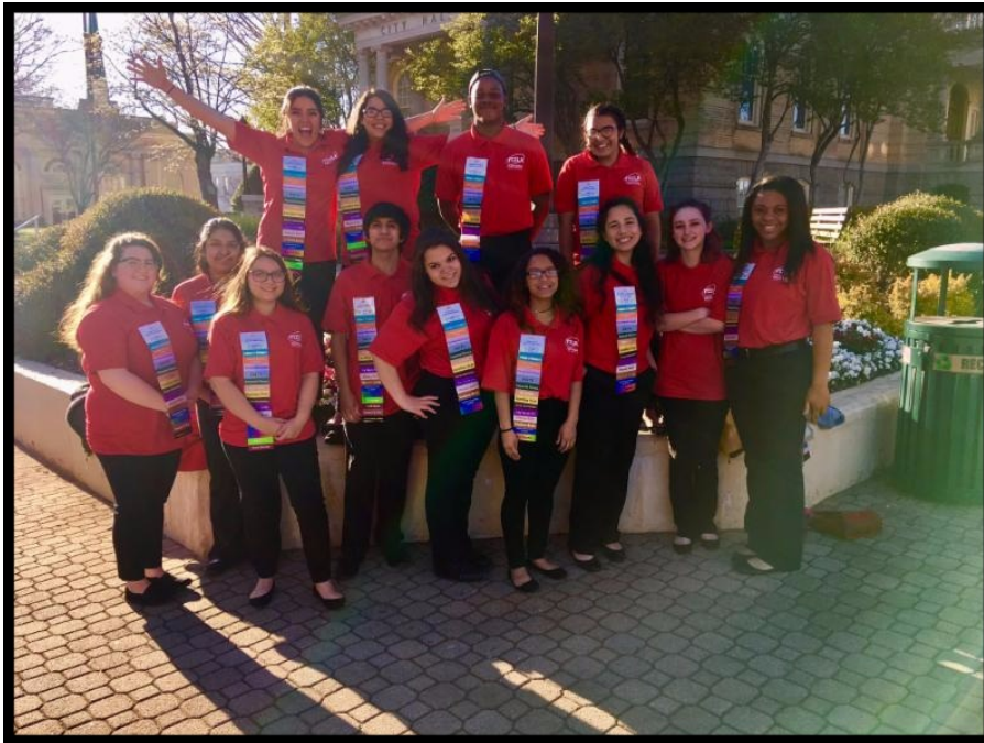
FCCLA winners advance to Nationals

FCCLA students are ready to hit the road to visit the "Music City of the USA" to compete in the southern city known for its connection to the country music industry. In July, FCCLA Star Event competitors will travel to Nashville, Tennessee to compete in the FCCLA National Leadership Competition and Conference. During the recent FCCLA state competition, Gainesville High School's FCCLA chapter won the Honor Roll with Distinction Award for the group's hard work and participation in local, state, and national programs.