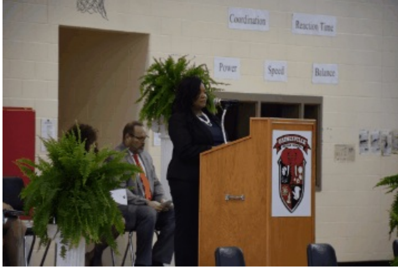
GMS Junior Honor Society Induction Ceremony