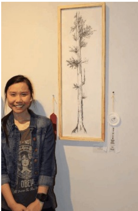
GHS art students showcase their artwork

Gainesville High School artists featured their unique artworks in the Charles J. Thurmond Youth Art Scholarship Competition and the Kiwanis Club of Gainesville's Visual Arts Showcase. Students entered