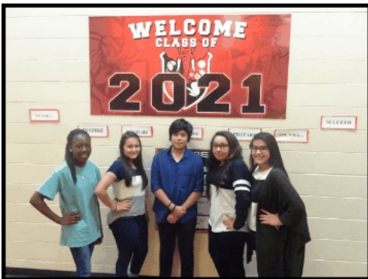
2016 REACH Georgia Scholars