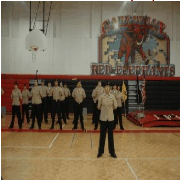
Caets prepare for a nnuual inspection

On March 24th, the GHS NJROTC program held its Annual Military