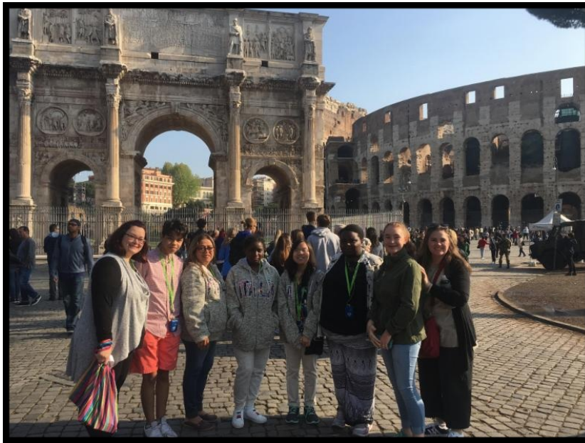
Students tour Italy's famous landmarks

Students at Gainesville Middle School had the opportunity to travel to Italy during their Spring Break. Four students along with chaperones enjoyed nine amazing days of learning about the interesting country. Students were able to tour various landmarks in Italy as well as experience the Italian culture and cuisine. The group visited famous landmarks such as St. Mark's Square, Doge's Palace, and the Leaning Tower of Pisa. In Rome which is Italy's capital, the students toured the Roman Colosseum and the Roman Forum. The students learned that in Italy the entree is always pasta, and they got a chance to taste an Italian dessert - gelato. It was a great educational experience for the students to explore a country that they often read about in stories and history books.