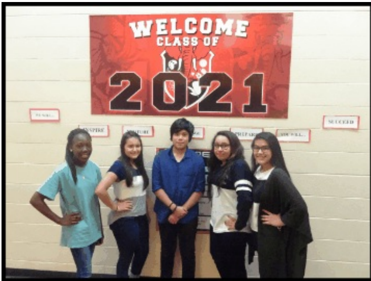
2016 REACH Georgia Scholars

Gainesville City School System encourages the community to support our REACH Georgia Scholars program by making a financial contribution to provide an opportunity for select GCSS students to pursue a college education. REACH Georgia is a needs-based scholarship program that pairs middle school students (Scholars) with mentors, coaches and additional resources to prepare them for college and careers. REACH Scholars who successfully complete the program and graduate from high school earn a $10,000 scholarship paid over four years at a Georgia college or technical college of their choice. 100% of all donations collected will contribute toward REACH scholarships. To download a pledge form, please click here . For additional information regarding the REACH program, please click here .