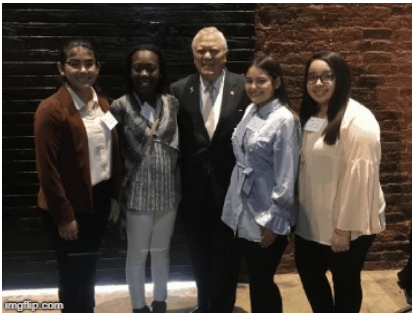
GHS scholars attend REACH Day at the Capitol