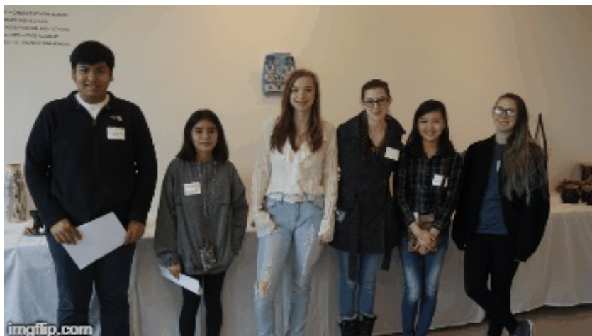
Student show art pieces at Ceramics Art Symposium