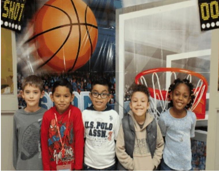
Math Madness grade level winners