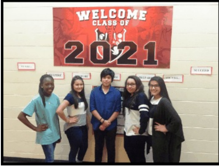
2016 REACH Georgia Scholars

Gainesville City School System encourages the community to support our REACH Georgia Scholars program by making a financial contribution to provide an opportunity for select GCSS students to pursue a college education. REACH Georgia is a needs-based scholarship program that pairs middle school students (Scholars) with mentors, coaches and additional resources to prepare them for college and careers. REACH Scholars who successfully complete the program and graduate from high school earn a $10,000 scholarship paid over four years at a Georgia college or technical college of their choice. 100% of all donations collected will contribute toward REACH scholarships. To download a pledge form, please click here . For additional information regarding the REACH program, please click here .