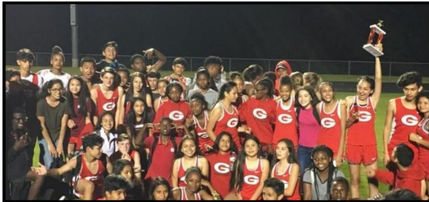
GMS Boys and Girls Track Teams claim championship title

The Gainesville Middle School Boys and Girls Track & Field teams claimed the title as the 2017 Hall County Champions. The team members worked hard for this coveted title, and their hard work and perseverance finally paid off as the track season comes to an end. Congratulations to the teams and coaches for their commitment to making GMS #1 in the county!