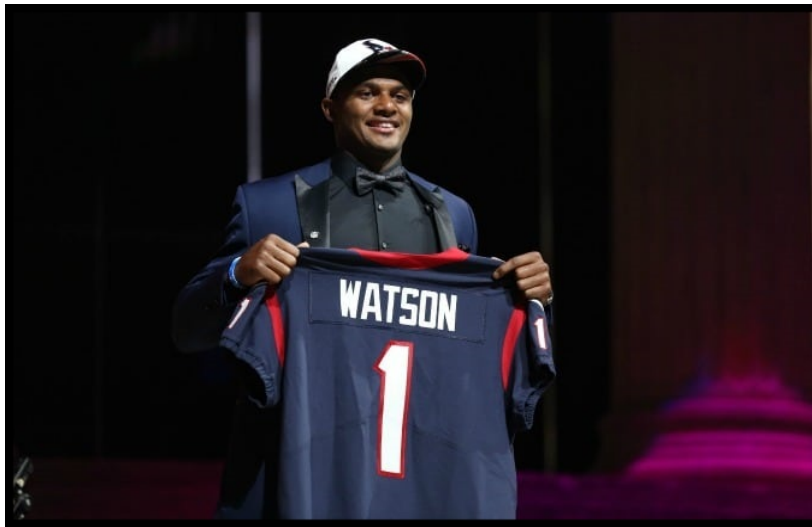
Deshaun Watson drafted by Houston Texans

Congratulations to Deshaun Watson, Gainesville High School graduate and former Red Elephants quarterback, on being drafted in the first round of the NFL draft as the 12th pick for the Houston Texans! We are proud of you and all that you have accomplished as a "Red Elephant"! GCSS wishes you the best of luck as you continue to excel in your professional football career! #DW4HoustonTexans