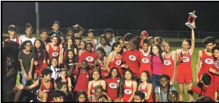
GMS Boys and Girls Track Teams claim championship title

The Gainesville Middle School Boys and Girls Track & Field teams claimed the title as the 2017 Hall County Champions. The team members worked hard for this coveted title, and their hard work and perseverance finally paid off as the track season comes to an end. Congratulations to the teams and coaches for their commitment to making GMS #1 in the county!