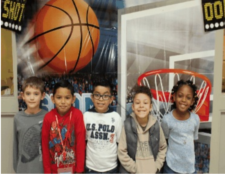
Math Madness grade level winners