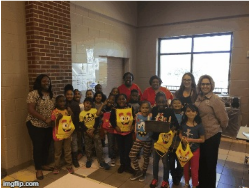
Students learn about good nutrition through partnership

Recently, Gainesville City School Nutrition partnered with the Boys and Girls Club's afterschool program at Fair Street for a unique edible, educational experience! Students started a mini pizza garden for the Fair Street cafeteria, featuring oregano, parsley, basil, tomatoes, and spinach. They also learned about the plant life cycle, raced in a "parts of the plant" relay, and planted their own seeds to take home. The joint venture was a great way to teach students about nutrition and how they can personally play a major role in maintaining good nutrition in their daily lives. Hopefully, all of the students were inspired to begin their own mini gardens in their backyards to grow nutritious fruits and vegetables.