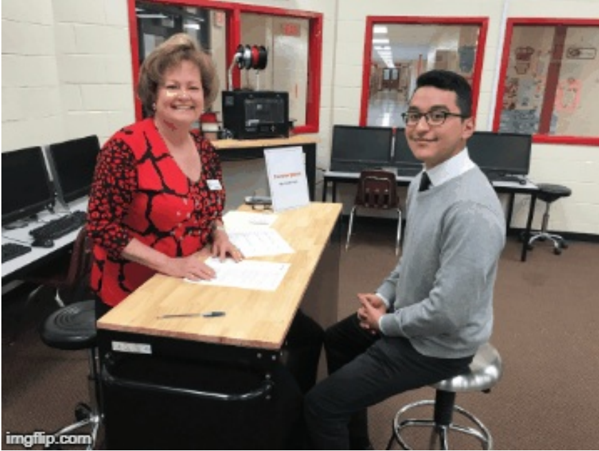
GHS CTAE students participate in mock interviews

Gainesville High School had 165 CTAE students who participated in mock interviews at the Ninth Grade Center and the GHS Media Center. The purpose of the mock interviews was to prepare students for real job interviews as they enter the workforce. The participants had to come prepared with their resumes in hand and dressed in professional attire.