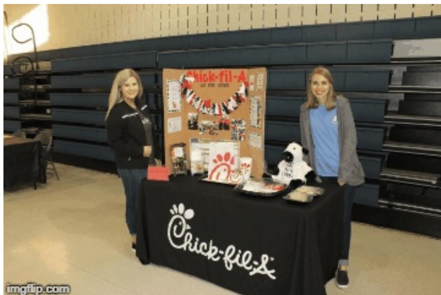
New Holland hosts annual Career Day

Recently, New Holland held its annual Career Day event. Students met with various businesses and organizations around Hall County to get an idea on what careers they would like to pursue when they grow up. Visitors were represented from the Gainesville Police Department, Gainesville Fire Department, Chick-Fil-A, Wilson Orthodontics, Wells Fargo Bank, Georgia Mountain Food Bank, Rock Solid Karate, the City of Gainesville, and many more. The students learned about the many roles and responsibilities and asked questions regarding the expectations of the various jobs. The annual event allowed students to make important connections with the local workforce industry to assist them in choosing their future careers.