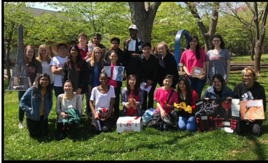
Award Winners at World Language Day

Forty students from Gainesville High School participated in the 42nd annual University of North Georgia (UNG) World Language Day on April 12th in Dahlonega. The group presented several exhibits and performances for competition, winning 14 awards overall including four 1st place awards and a Blue Ribbon Grand Prize.