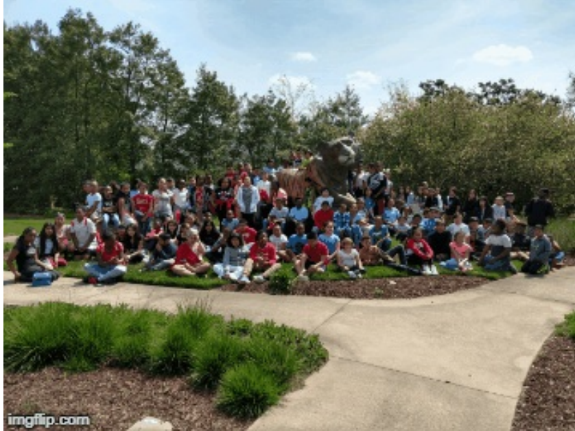
Fair Street Academy and Brenau create "kindness" garden

Fair Street's fifth graders and Connections teachers embarked on a walking field trip to Brenau University on April 13th for the dedication of a joint project between the two schools. Brenau reserved some space on its campus for the creation of a Kindness Rock Garden in which both Brenau and Fair Street students painted rocks to contribute to the garden.