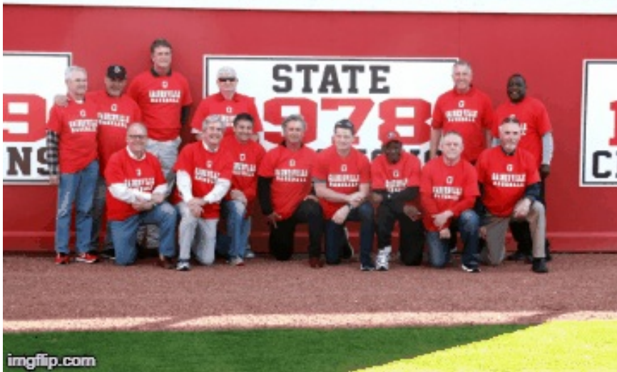
1978 GHS Baseball team celebrates 40th anniversary