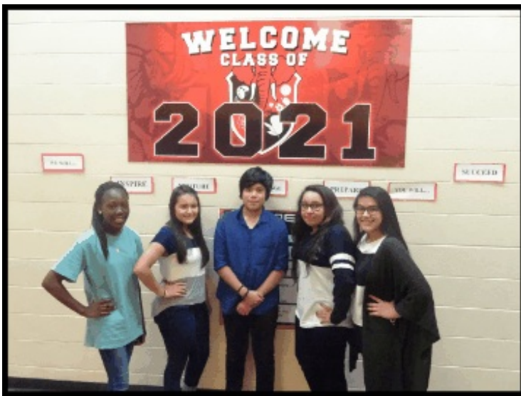
2016 REACH Georgia Scholars

Gainesville City School System encourages the community to support our REACH Georgia Scholars program by making a financial contribution to provide an opportunity for select GCSS students to pursue a college education. REACH Georgia is a needs-based scholarship program that pairs middle school students (Scholars) with mentors, coaches and additional resources to prepare them for college and careers. REACH Scholars who successfully complete the program and graduate from high school earn a $10,000 scholarship paid over four years at a Georgia college or technical college of their choice. 100% of all donations collected will contribute toward REACH scholarships. To download a pledge form, please click here . For additional information regarding the REACH program, please click here .