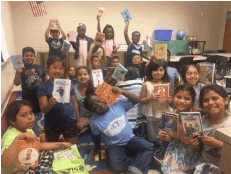
Fair Street is the epicenter for many summer programs

Each year Fair Street International Academy proudly houses a myriad of summer programs, where hundreds of students pass through the school's doors each day. Children come to Fair Street during the summer months to learn and have fun in programs offered by the Boys and Girls Club and the GCSS Migrant program.