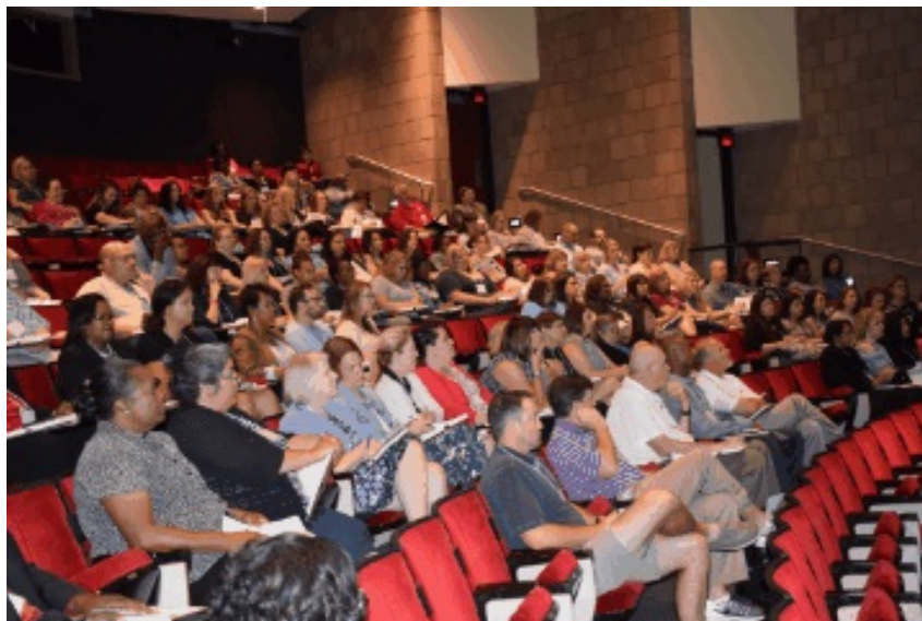
2017 GCSS Summer Leadership Summit

Approximately 150 district and school leaders convened at the district's third annual Summer Leadership Summit held June 5 - 7, 2017, at the Brenau Downtown Center and GHS Ninth Grade Center.