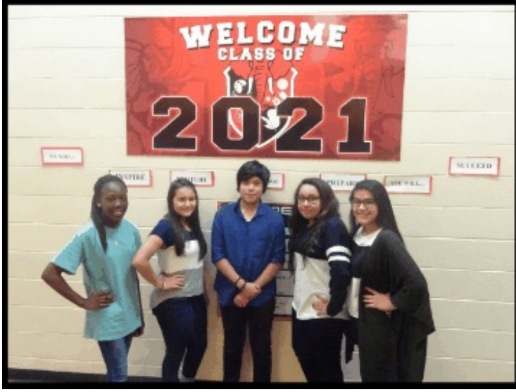
2016 REACH Georgia Scholars

Gainesville City School System encourages the community to support our REACH Georgia Scholars program by making a financial contribution to provide an opportunity for select GCSS students to pursue a college education. REACH Georgia is a needs-based scholarship program that pairs middle school students (Scholars) with mentors, coaches and additional resources to prepare them for college and careers. REACH Scholars who successfully complete the program and graduate from high school earn a $10,000 scholarship paid over four years at a Georgia college or technical college of their choice. 100% of all donations collected will contribute toward REACH scholarships.