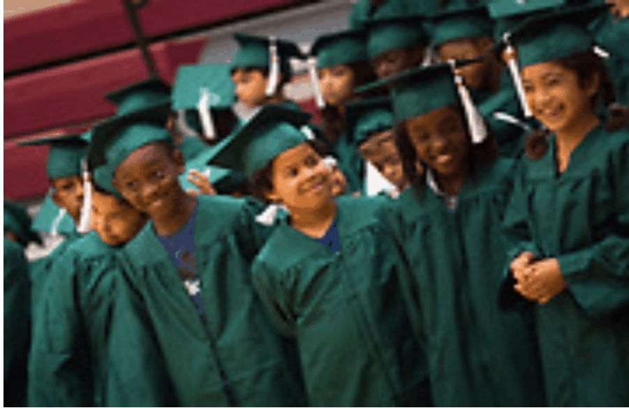
GCSS graduates of RISE summer program

This summer one hundred and eighteen students from the Gainesville City School System participated in the RISE (Real Interactive Summer-learning Experience) Summer Program commemorating the sixth year of a joint partnership between Gainesville Housing Authority, Gainesville City School System, United Way of Hall County, and Brenau University. On July 14th, GCSS students concluded the 6-week program with a RISE commencement held at Fair Street International Academy with friends and family in attendance. Graduation activities included a processional followed by student presentations and a keynote address. Students were all smiles as they received certificates for their satisfactory completion of the program.