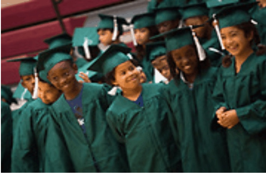
GCSS graduates of RISE summer program

This summer one hundred and eighteen students from the Gainesville City School System participated in the RISE (Real Interactive Summer-learning Experience) Summer Program commemorating the sixth year of a joint partnership between Gainesville Housing Authority, Gainesville City School System, United Way of Hall County, and Brenau University. On July 14th, GCSS students concluded the 6-week program with a RISE commencement held at Fair Street International Academy with friends and family in attendance. Graduation activities included a processional followed by student presentations and a keynote address. Students were all smiles as they received certificates for their satisfactory completion of the program.