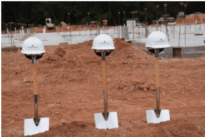
Enota groundbreaking event