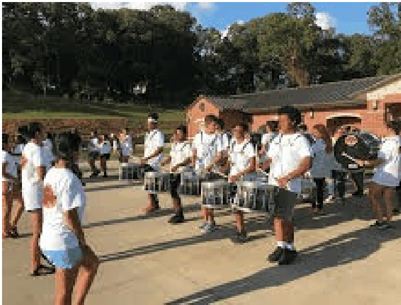
First Annual Community Pep Rally

Gainesville High School held its first annual fall sports community pep rally on August 16th at City Park stadium. The "Big Red Machine" band along with the cheerleaders did an amazing job of getting everyone excited about the fall sports season. The head coaches of each fall sport took a few minutes to talk about their program and introduced their senior athletes. Red Elephant fans were able to visit the concession stand for food and enjoy Kona Ice while young fans were entertained with bounce houses. It was a great time of food, fun, and fellowship with the Gainesville community.