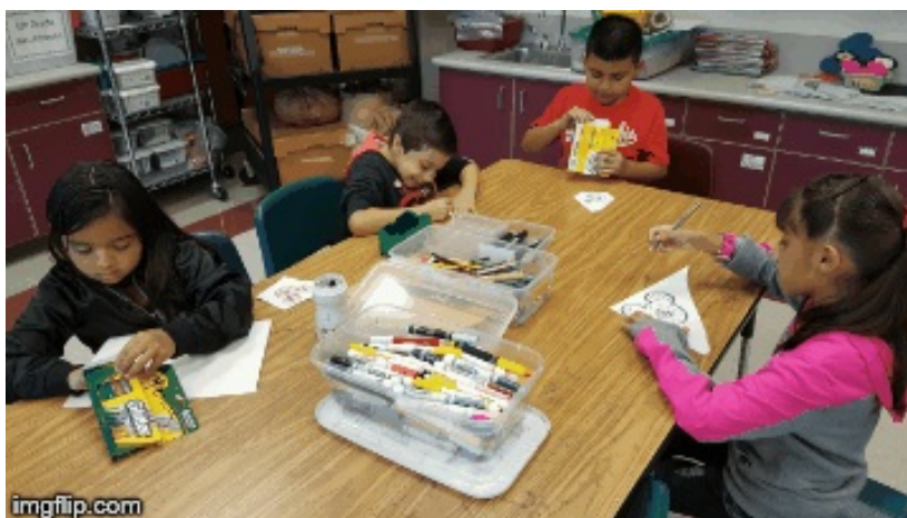
Students create "Hidden Mickey" artwork

At Gainesville Exploration Academy, the art department and STEAM program have joined together to become "Imagineers" for the school year. Special projects have been planned based on the Disney theme in spirit, techniques, and aesthetics. One fun project that is currently