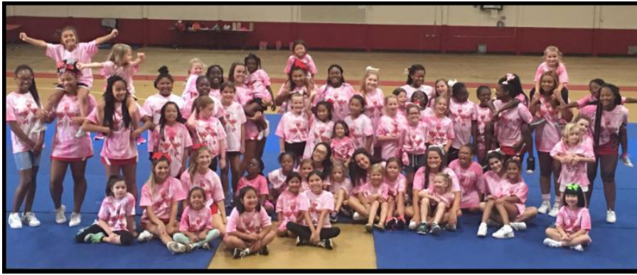
Baby Elephant Cheer Camp 2017

The GHS Varsity Football Cheerleaders hosted the Baby Elephant Cheer Camp at the GHS Alumni Gym on July 17th-20th. Over 45 campers ranging from ages 3 to 14 learned cheers and dance moves during the four day camp. The campers also created arts and crafts and cooked a variety of snacks. The young "cheerleaders to be" enjoyed learning new skills and techniques from the varsity cheerleaders who they consider as their role models. The community will have an opportunity to see the Baby Cheer Elephants in action during the Elephant Walk on August 18th at 6:00 p.m. at City Park! These young cheerleaders are ready to cheer their favorite chant for the Big Red Elephants - "Let's Go Big Red!!!"