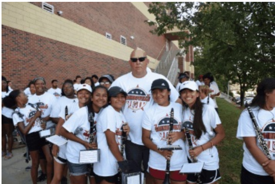
GCSS Big Red Rally 2017