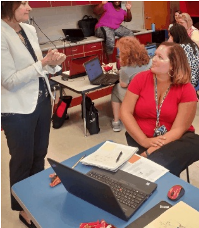
Teachers at New Holland engage in new classroom strategies

Can teachers learn new things at school? Of course, they can! Since