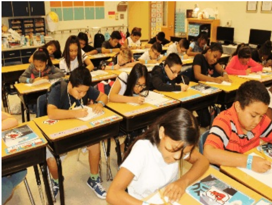
First day of school goes smoothly at GCSS

Summer is officially over! The much anticipated day has finally arrived (and passed) - "the first day of school"! On August 2nd, the school system opened its doors to approximately 8000 students eager to begin a new year of learning. For those students entering the