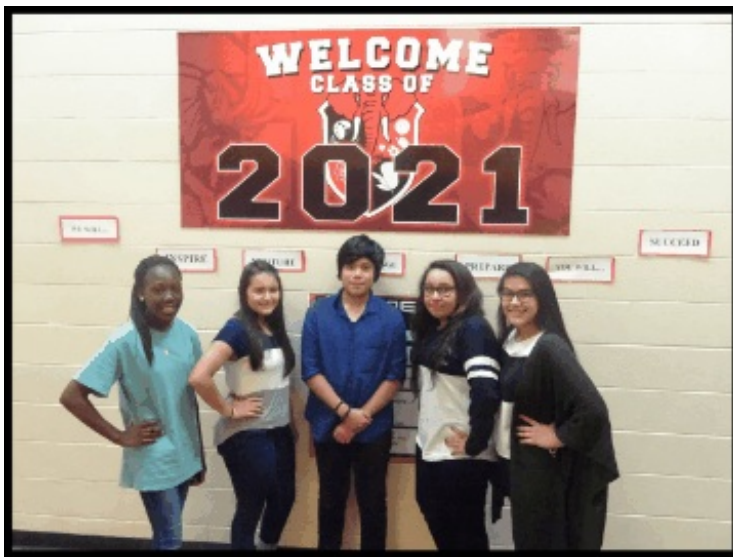
2016 REACH Georgia Scholars

Gainesville City School System encourages the community to support our REACH Georgia Scholars program by making a financial contribution to provide an opportunity for select GCSS students to pursue a college education. REACH Georgia is a needs-based scholarship program that pairs middle school students (Scholars) with