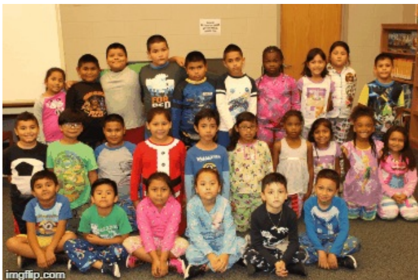
PBIS Week at New Holland

During the week of September 5th - 8th, New Holland celebrated its PBIS Kickoff Week! It was an exciting time to get students fired up about all of the wonderful incentives they will be able to earn this school year as New Holland continues to implement PBIS (Positive Behavioral Interventions and Supports).