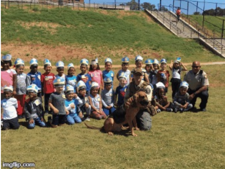
Community Helpers visit Mundy Mill students

The Kindergarten classes at Mundy Mill Learning Academy wrapped up their Community Helpers unit with a visit from the Hall County Police Department. The students experienced first-hand the many ways that officers help us each day. The officers brought their police dogs and demonstrated the unique abilities these canine officers have when on the job. The kindergartners enjoyed the visit from their favorite community helpers, and someday the students hope to be great role models by being community helpers too!