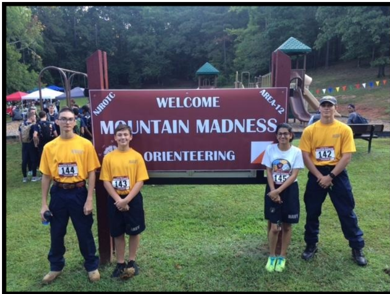
Cadets endure a mountain of madness in ROTC training