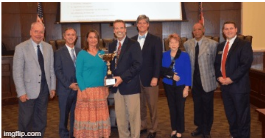
Board of Education Recognitions