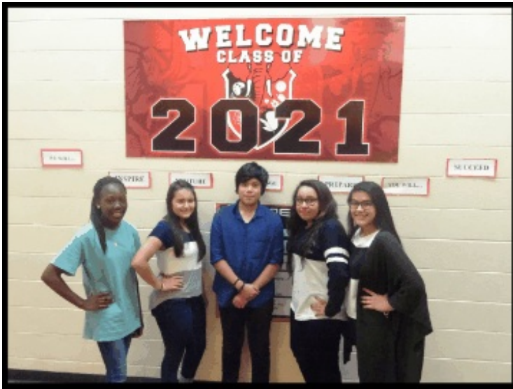
2016 REACH Georgia Scholars

Gainesville City School System encourages the community to support our REACH Georgia Scholars program by making a financial contribution to provide an opportunity for select GCSS students to pursue a college education. REACH Georgia is a needs-based scholarship program that pairs middle school students (Scholars) with mentors, coaches and additional resources to prepare them for college and careers. REACH Scholars who successfully complete the program and graduate from high school earn a $10,000 scholarship paid over four years at a Georgia college or technical college of their choice. 100% of all donations collected will contribute toward REACH scholarships.