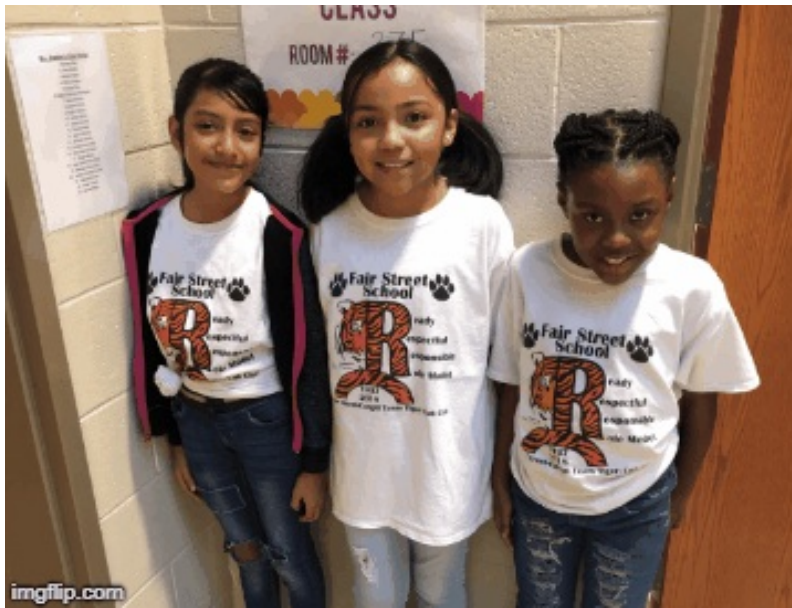
Twins roam the halls at Fair Street Academy

If you visited Fair Street last week, you may have thought that you were seeing double! In fact, not only were you seeing double - but you were actually seeing twins. Students and staff teamed up with their peers to enjoy being twins for a day as part of the school's PBIS initiative. Dressing as twins was a fun way to make the school day even more exciting, and it was a funny trick to play on visiting guests who thought that they were experiencing double vision!