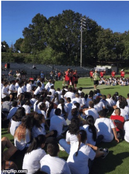
Students participate in Falcons character camp

September 26th was a busy day for the Atlanta Falcons in Gainesville. On one side of town, the team hosted a grant presentation ceremony, while less than 5 miles away, the Falcons sponsored a character camp for local students. The NFL Play 60 Character Camp held at Bobby Gruhn Field was a free camp that included grade levels 3 through 8. Students from Gainesville Middle School and GCSS elementary schools as well as other local schools were selected to attend the three-hour event, with each participant receiving a t-shirt, gift bag, and lunch provided by Subway. Assisting with the event were USA Football Heads Up certified coaches and current Falcons players. The camp focused on teaching introductory level football skills, reinforcing the Play 60 message of eating healthy and exercising for 60 minutes a day, and emphasizing 10 character