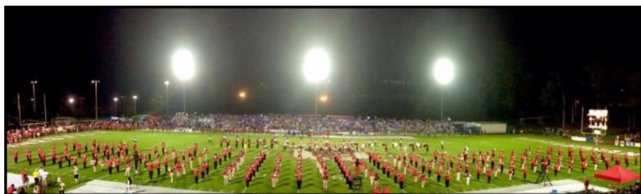
Big Red "Grand Champion"