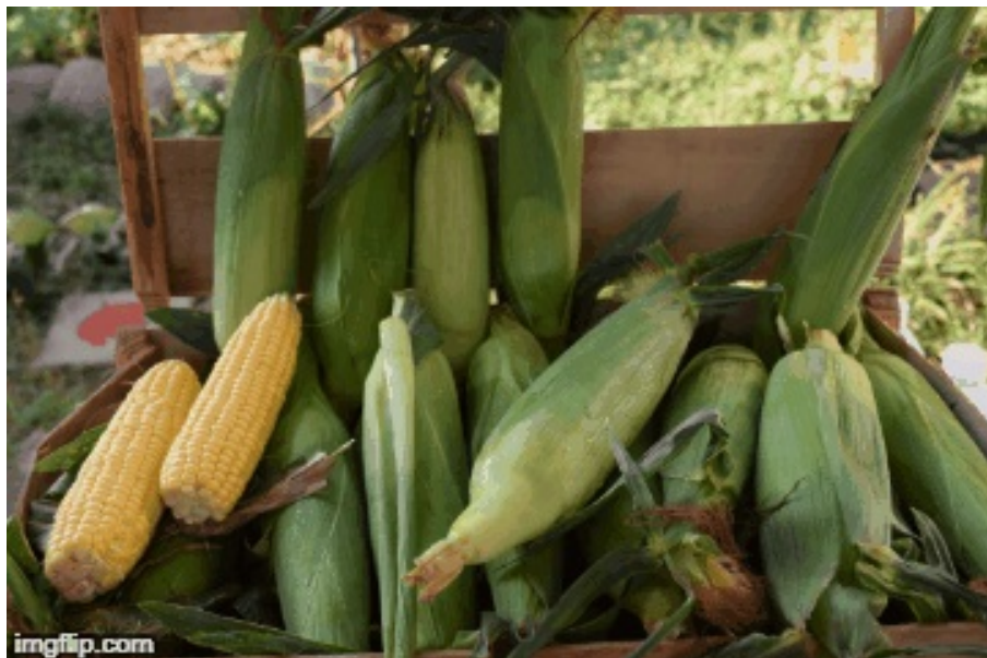
Gainesville Exploration students compete in corn shucking