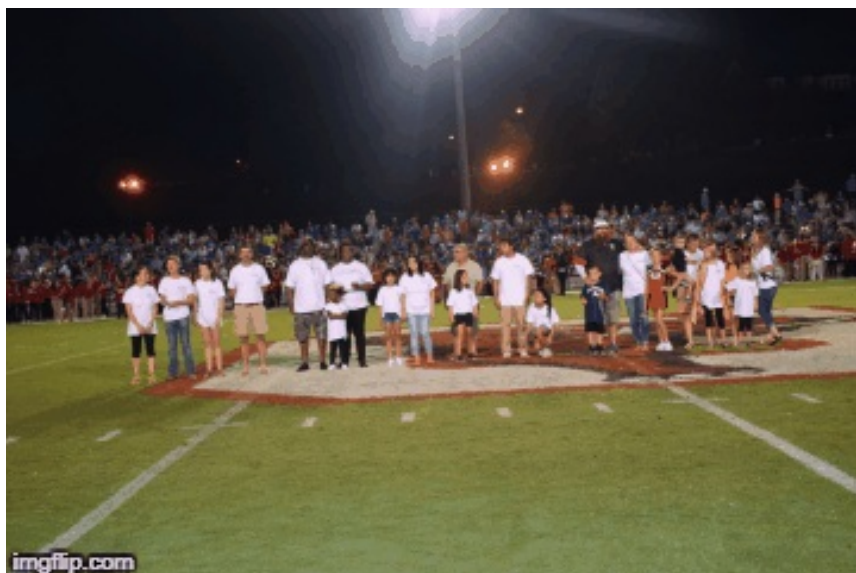
Supporting our GCSS families in annual "Gold Out"

September is observed as Childhood Cancer Awareness Month to recognize the nearly 16,000 children under the age of 21 diagnosed with cancer every year in the U.S. The objective is to emphasize the types of cancer that affect children, to address survivorship challenges, and to raise money for research.