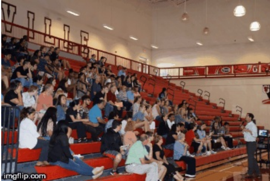
Peach State College Tour at GHS

Gainesville High School students and their parents had an opportunity to receive college information at the Peach State College Tour Information Session on August 27th at GHS. Representatives from Georgia State University, Georgia Tech, and the University of Georgia gave presentations regarding specific requirements and criteria at their schools.