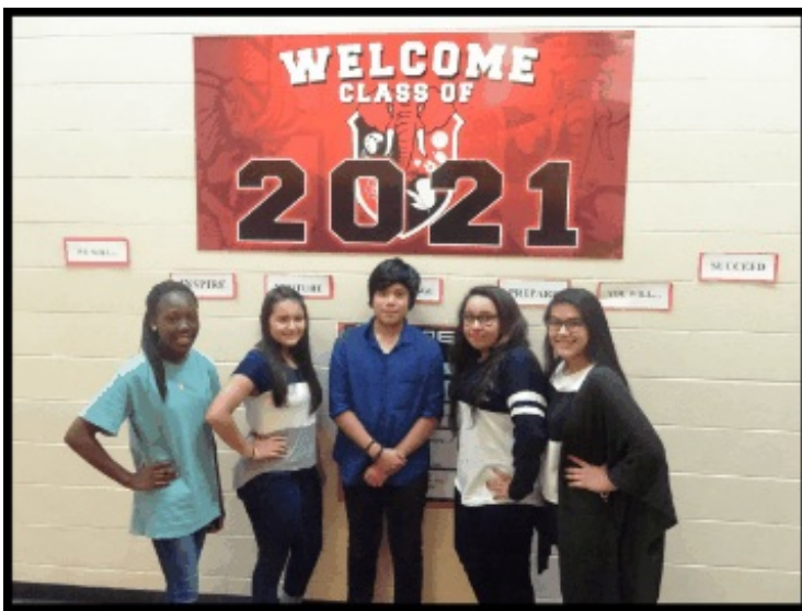
2016 REACH Georgia Scholars

Gainesville City School System encourages the community to support our REACH Georgia Scholars program by making a financial contribution to provide an opportunity for select GCSS students to pursue a college education. REACH Georgia is a needs-based scholarship program that pairs middle school students (Scholars) with mentors, coaches and additional resources to prepare them for college and careers. REACH Scholars who successfully complete the program and graduate from high school earn a $10,000 scholarship paid over four years at a Georgia college or technical college of their choice. 100% of all donations collected will contribute toward REACH scholarships.