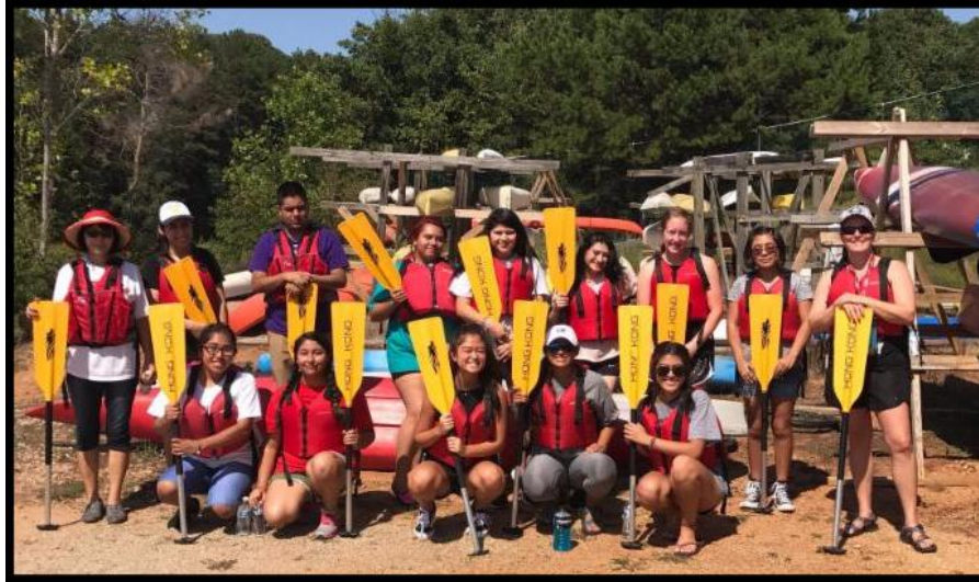
Chinese and French Club students prepare for dragon boat race