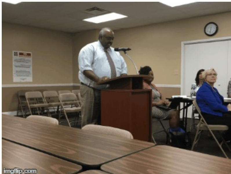
District staff presents agenda reports to School Board