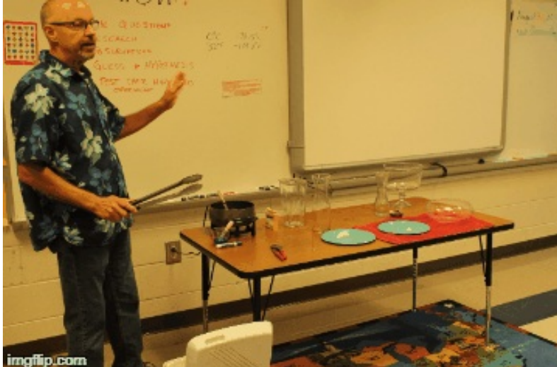
Students enjoy fun learning activities