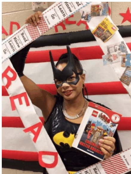
Characters welcome students to school