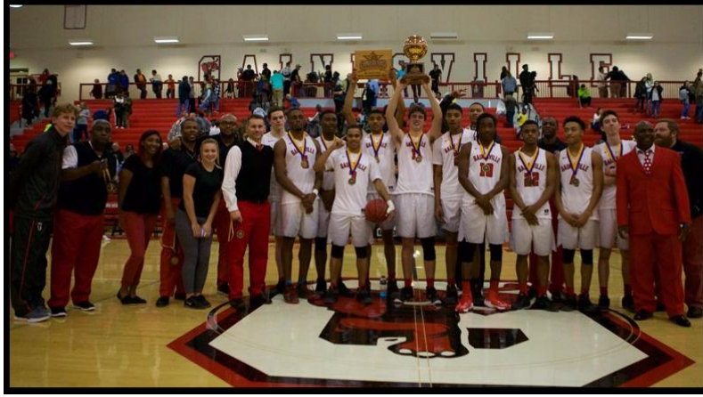
2016 Lanierland Champions