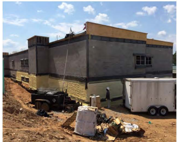
Spray Foam Insulation